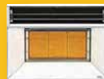
Available in Natural Gas & LPG

Input: 24MJ, 7.0kw Width: 505mm Height: 332mm Depth: 417mm Weight: 10kg