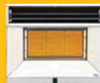
Available in Natural Gas

Input: 25MJ, 7.0 kW Width: 505mm Height: 359mm Depth: 419mm Weight: 10kg