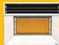
Available in Natural Gas & LPG

Input: 24MJ, 7.0kw Width: 505mm Height: 332mm Depth: 417mm Weight: 10kg